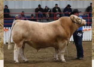
SIRE HIGH BLUFF JACK DANIELS 124J