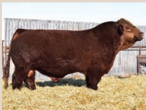
SIRE BLACK GOLD APPROVAL 71E

A Black Gold Approval son whose dam is a good looking Driller daughter with a bit of extra punch. I like the masculine head that starts this bull off. Moving back behind that front shoulder he has a nice pattern and smoothness to him.