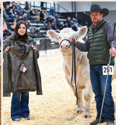
LOT 1 HRJ LANDSLIDE 310L