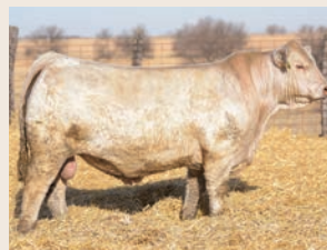
SIRE SCCG TRIED AND TRUE 8507

CE 7.9 // BW 1.3 // WW 65 // YW 105 // Milk 33 // MCE 5.9 // MTL 66