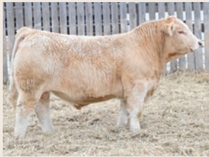
SIRE HRJ THE JUDGE 111J

Live Wire was an early maturing bull that has had that herdbull presence and drive since he was a young calf. Tremendous length of body, solid foot structure and heavy haired. His name was inspired by his vocal herdbull presence.