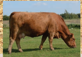
DAM EGC WANDA 11G