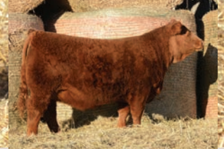
DAM EGG RED LASHES 75J