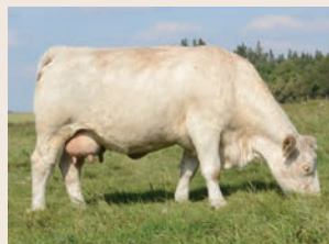
DAM HIGH BLUFF TRIUMPH 3E

Lucas combines a balanced physique and exceptional musculature design that will make him a versatile asset for any breeding program. Like all the JJ sons, Lucas displays great maturity and development at a young age.