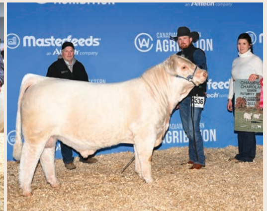
LOT 1 HRJ LANDSLIDE 310L