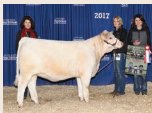
FULL SISTER TO DAM HIGH BLUFF ESPERENZA 101E

CE 12.4 // BW -0.7 // WW 64 // YW 124 // Milk 17 // MCE 12.0 // MTL 49