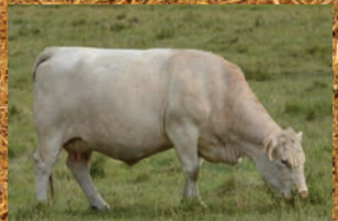
DAM HIGH BLUFF ESPERENZA 15Y