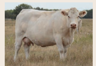
DAM HIGH BLUFF JIVE 138C

In the business that is paid by the pounds Luck Now is one business minded individual. Amongst his peers he ranked second at weaning and second at yearling. Serious cattlemen take note this is one bull that will increase that bottom line and improve profitability in that next calf crop. His dam is a cow that always looks great in the pasture. I think we have pictured her almost every summer. She is a big, beautiful Triumph daughter that goes back to a big beautiful Hank cow. While her bull calf has a bit more birthweight, she is one of our biggest females, so percentage wise he's only 5.5% of her weight.