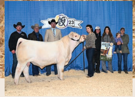
RESERVE CHAMPION MB AG EX 2024 43L