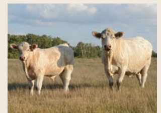
DAM HIGH BLUFF FRAN 177F & 48L

A very complete and properly constructed individual. He combines muscle shape and density, softness and added depth through his lower third and attractive out through his front end. Heavy haired and sound to the ground. His dam is an exceptional female that carries a ton of overall body mass and attractive design. HOMO POLLED. PARENT VERIFIED