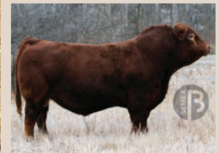
SIRE WS EPIC E152

What a handsome lad this fellow is. The Epic stamp of hair, muscle shape and quiet disposition. Lazarus started out at only 73 pounds and weighed in right around the pen average. A nice combination of calving ease and grow. His dam is a good looking Driller female. This was a friendly pair in the pasture all summer.