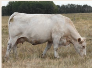
DAM HIGH BLUFF NATASSIA 7E

A smooth made Ballyhoo son with great length of body, muscle shape and hair coat. A good mix of calving ease and performance. His dam High Bluff Natassia 7E is a favourite around here. We have bred her 5 different ways and each way works and they rank highly in weaning and yearling weights. After 4 bulls in the bull sale the last 4 years she finally gave us another female, a great looking Innovation heifer calf we are excited about already. Natassia has a friendly disposition and exceptional udder quality and is solid in her structure. We really love our Triumph cows and she comes to the top of our favourites.