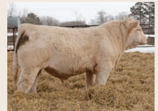
MATERNAL BROTHER HIGH BLUFF GUINNESS 162G

Loaded Up is loaded with all the qualities and attributes that one strives to achieve. Big topped, square hiped, bold sprung in his fore rib and wrapped in a heavy haired package. All summer him and his dam caught our eye. Easy to know why when he weaned in at 1020 lbs. His dam HBSF 154B is a big bodied female that is known for producing offspring with extra body, thickness, shape and hair. HOMO POLLED. PARENT VERIFIED