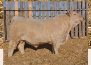
SIRE HIGH BLUFF EL PASO 15E