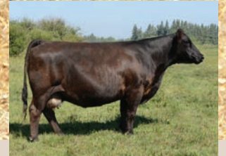
DAM EGC LASHES 4C