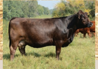
DAM EGC BLACK LASHES 36G