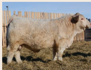
PATERNAL GRANDSIRE GAME ON 78G

CE 9.7 // BW -0.6 // WW 72 // YW 117 // Milk 28 // MCE 6.3 // MTL 64