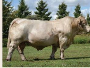
SIRE OF LOTS 33 & 34 SCR TRIUMPH 2135

CE 5.4 // BW 1.1 // WW 71 // YW 138 // Milk 15 // MCE 6.7 // MTL 50