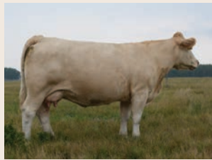
DAM HIGH PLUFF PEACHES 21C

Keep the color and add the profitability. A very complete son of HRJ Judge that has that extra shape, stoutness, solid color and wooly hair. His sire was added to the AI list last year for his muscle pattern, hair coat and strong maternal background.