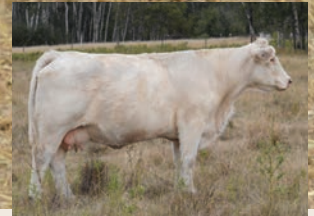
DAM HIGH BLUFF LADY SLIPPER 72F