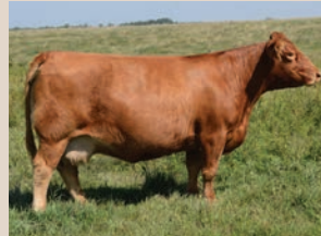
DAM EGG RED LASHES 77B

CE 8.5 // BW 2.6 // WW 80 // YW 121 // Milk 24 // MCE 3.7 // MWW 64