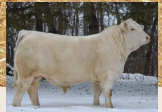
SIRE HIGH BLUFF CASANOVA 13C