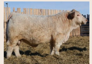
MATERNAL GRANDSIRE & SIRE TO HIGH BLUFF JJ 85J HIGH BLUFF GAME ON 78G

Length of spine in cattle equates to more pounds in pay weight and Logan has the stretch to add to the profitability. Laura 137J carried this guy right along to an impressive ActWW of 1020, no easy task for any cow even more impressive for a 2yr old with her first calf. Power and performance with the smoothness and structural design of calving ease. HOMO POLLED. PARENT VERIFIED