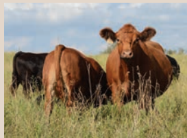
DAM EGC MS MUCHMORE 81F