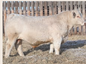
SIRE HRJ JUSTICE 104J

CE 11.3 // BW -1.9 // WW 69 // YW 112 // Milk 25 // MCE 8.1 // MTL 59