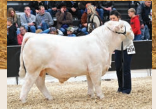
PATERNAL GRANDDAM 942D