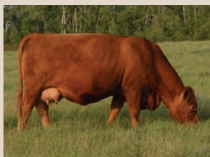
DAM EGF JEMMA 38F

Lonestar is a standout solid red bull that exudes masculinity and character. He has a great masculine look to him. Lonestar boasts impressive thickness, depth, and a striking dark coat of hair. His dam is a gorgeous Driller female with a great udder. She looks just like what you want your next herdsire's dam to look like. Whether you are looking to make beautiful replacement females, add some masculinity and character and dark colour to your bull calves or make a great set of market cattle take a look here! Lonestar has the qualities and backing to help elevate your breeding program.