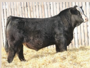
SIRE MADER SON OF ANARCHY 144H

Over here we are suckers for a herdsire with a cool look, a bull with some character and masculinity. It's something when we are bull shopping we always look for. This Son of Anarchy definitely has an attention grabbing look to him. His front quarter character makes him a true attention grabber in the pen. He's a moderate, smooth made bull that we think would be a good fit in a lot of programs.