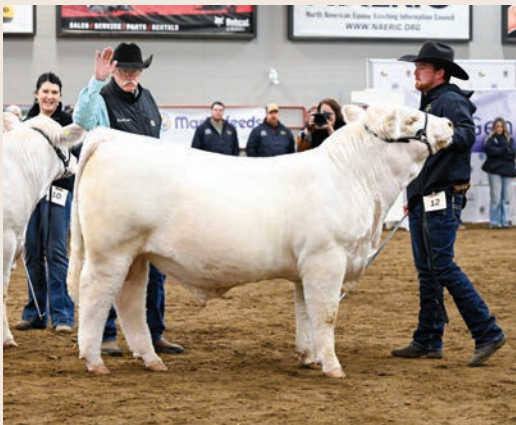
PAERNAL BROTHER HRJ LIMITLESS 303L 2024 PLAYERS CLUB CHAMPION $50,000 BULL JACKPOT