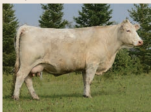
MATERNAL GRANDDAM HIGH BLUFF NATASSIA 95D