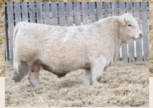
SIRE HRJ JOAQUIN 133J